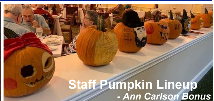
Staff Pumpkin Lineup