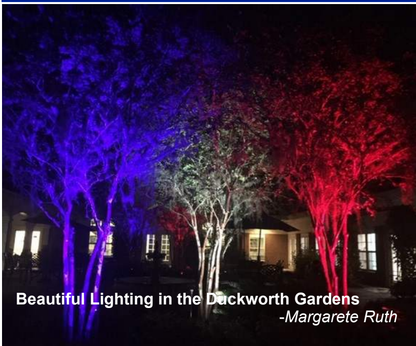
Beautiful Lighting in the Duckworth Gardens