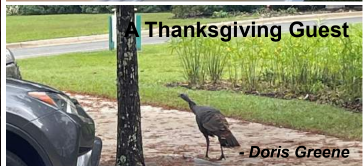
A Thanksgiving Guest